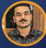
AL AMEEN S S SGPA 8.05