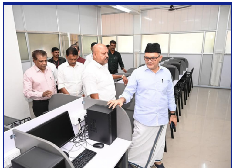
Inauguration of Online Computer Centre