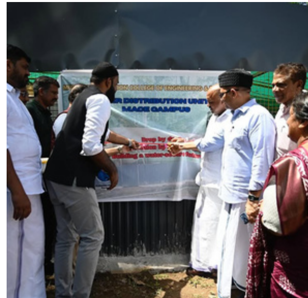
Inauguration of Water Distribution unit