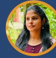
ATHIRA SGPA 8.18